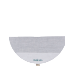
CFMH14 Half-sheet Double Tucked for 14" drums