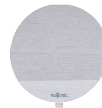
CFMF13 Full-sheet Double Tucked for 13" drums